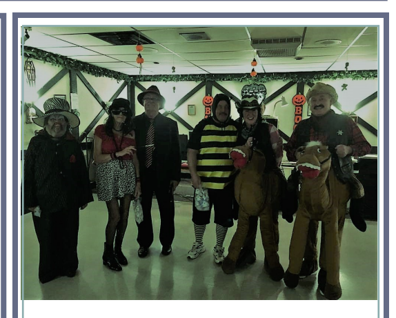
Winners of the Legion's Halloween Contest, October 27th.