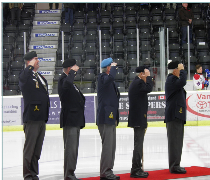
Veterans at the Cobourg Cougars'