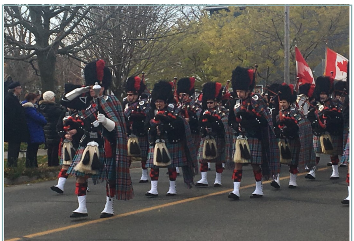
Cobourg Legion Pipes & Drums